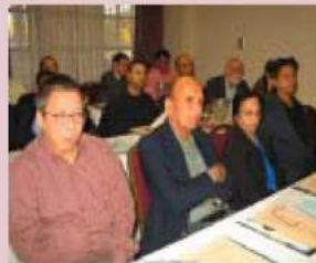
NAC Conference Participants San Bernardino, CA, January 6, 2007