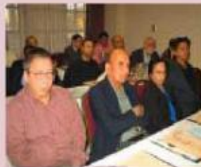
NAC Conference Participants San Bernardino, CA, January 6, 2007